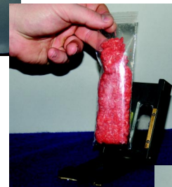
Place Bag in Sample Holder