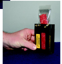
You're Ready to Analyze!

For Analysis ...Where you need it most ...When you need it most™